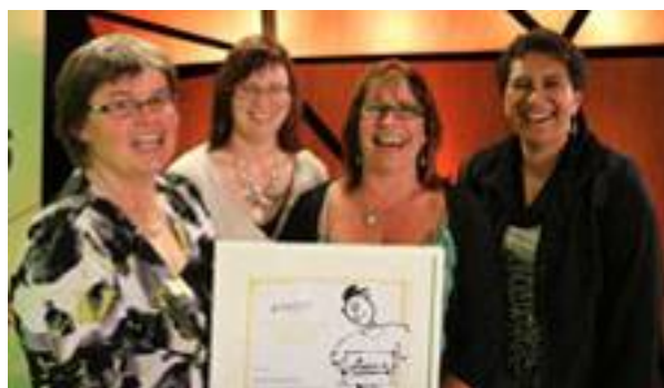
Netball Wellington Region

Wellington Airport Regional Community Awards Wellington Airport joins forces with Wellington Community Trust each year to recognise voluntary organisations that do so much to make our community a better place. These awards provide a way for people in the community to say thank you, as well as allowing those within the organisation to nominate their group to receive a reward for all their hard work. Wellington Airport recognises the value of volunteers and their work in strengthening the community. More